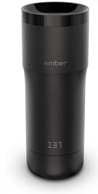
Ember Temperature Control Mug