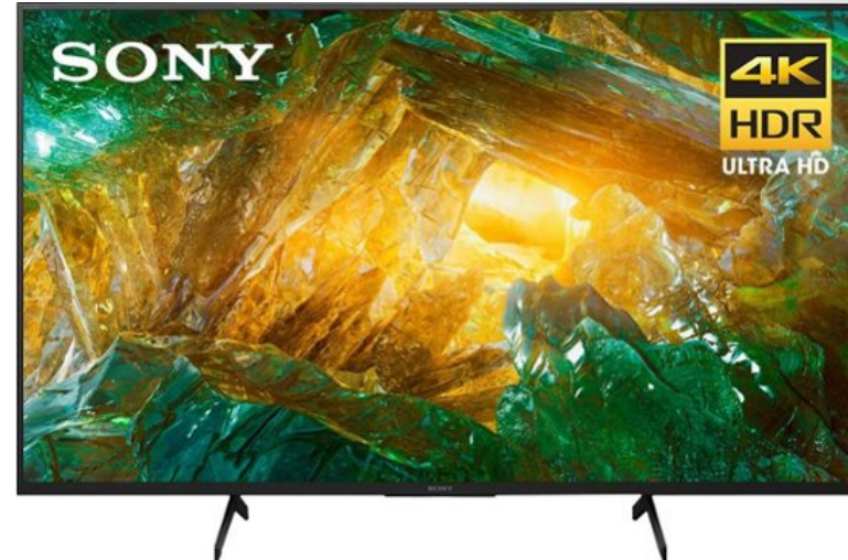
Sony 43 Inch 4K TV