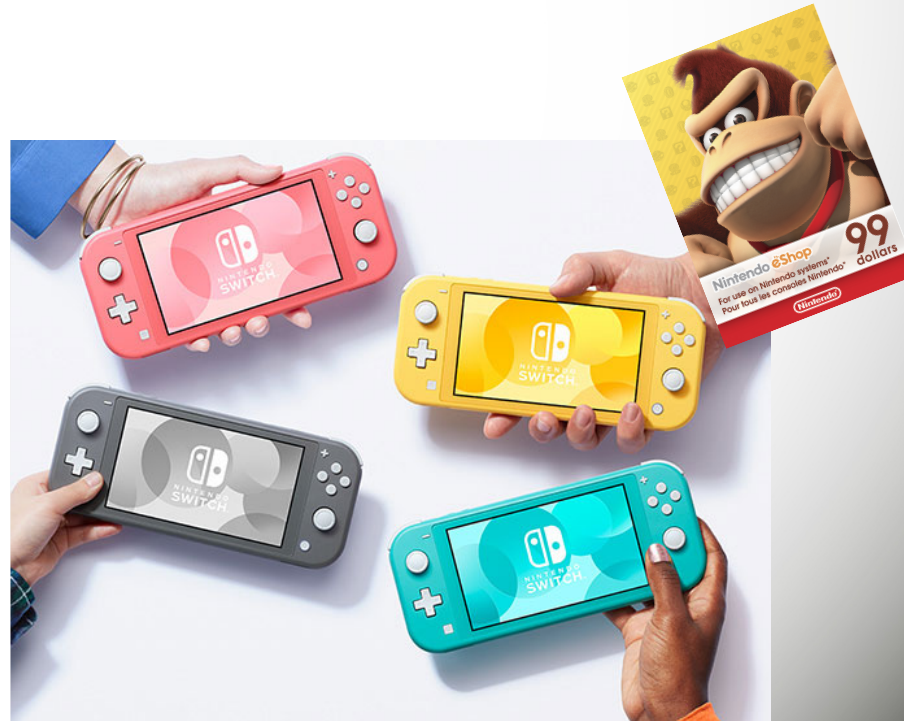
Nintendo Switch Lite w/ $99 eShop Card