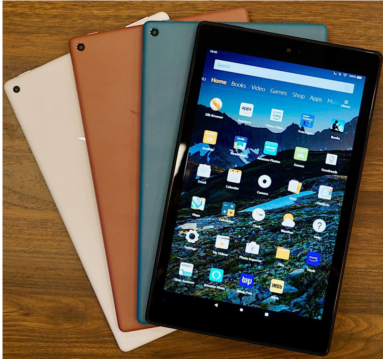
Fire HD 10 Tablet