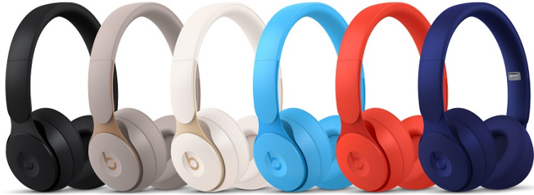
Beats Solo Headphones