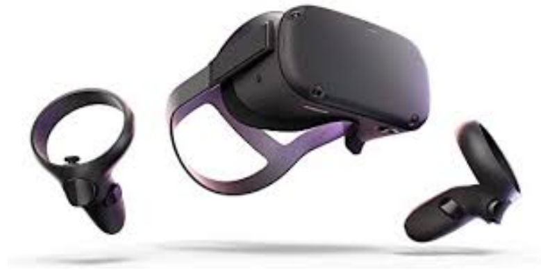
Oculus Quest All-in-One VR Headset